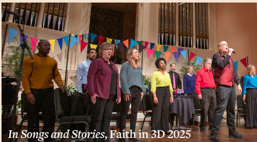
In Songs and Stories, Faith in 3D 2025

The three Ds in Faith in 3D stand for drama, dialogue and dessert. Productions have featured a performance followed by a moderated discussion and a time for dessert.