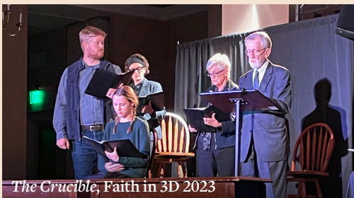
The Crucible, Faith in 3D 2023