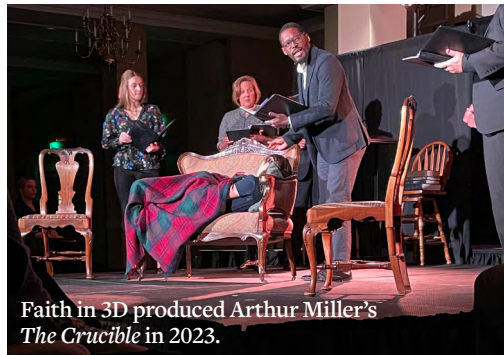
Faith in 3D produced Arthur Miller’s The Crucible in 2023.

■ To register your interest in auditioning, complete the form at wilshirebc.org/faith-in-3d-auditions by Monday, Sept. 16.