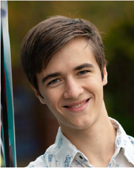
Noah Wagner School for the Talented and Gifted Texas A&M University